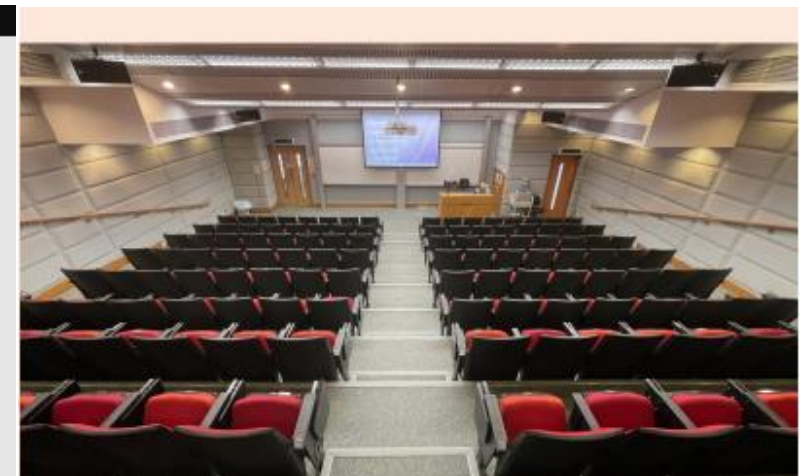
Note: Room 115 is located on the first floor of the building.